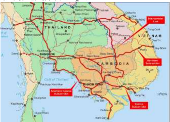
Fig 1 - GMS Economic Corridor

GMS Economic Corridor as show in Fig 1-2