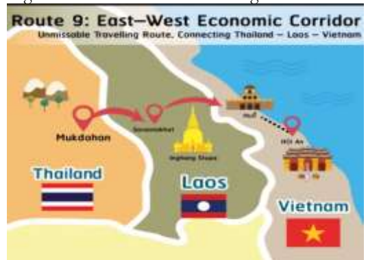
\label{lem:connectingThailand-Laos-Vietnam} Fig 3- The route connecting Thailand-Laos-Vietnam What is the impact from the East-West Economic Corridor?

The route connecting Thailand – Laos-Vietnam as fig 3