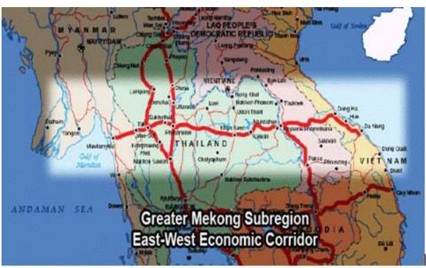
Fig 2 - GMS East West Economic Corridor Objectives of East West Economic Corridor

The main objectives of the East West Economic Corridor are (ADB, 2005)