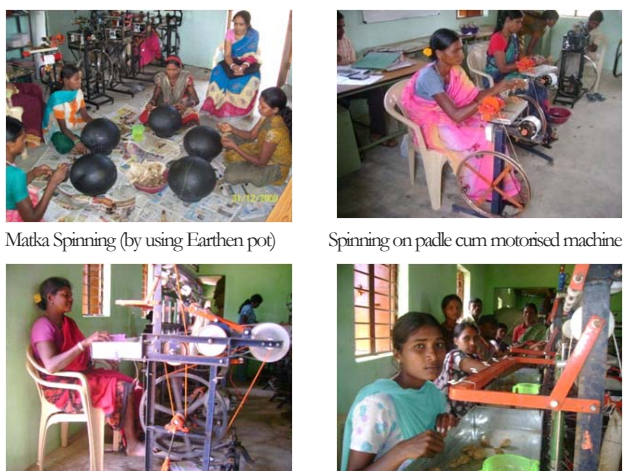
Women operating tasar reeling machines