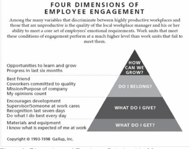
Figure 2: Dimensions of Employee Relationship Management.

Concept and Objective of Innovative Attributes of Employee Relationship Management: Motivating the men in the organization is the main aim of innovative process. Over the past three decades the world has seen enormous growth in information technology. Innovative Employee Relationship Practices places tremendous value on providing Quality, Service, and Innovation through employees possessing and exhibiting the right attitude and who take Ownership and Accountability for their work product. So the organization adopting policies and program to attract and retain a dedicated, loyal and longterm work force. Innovative programs foster long-term employment satisfaction and high employee retention.