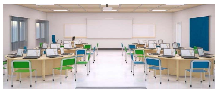
Image of smart classroom (Implementation of Smart Classroom Reaches Over 50% Schools-Education Ministry,n.d)

The blended learning on learner's academic performance in Rwandan public boarding school